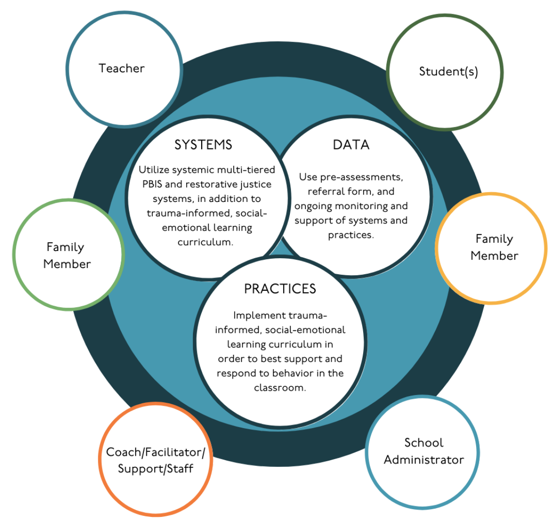
Figure I. Trauma-Informed Practice: Elements and Outcomes

It is clear that trauma-informed practices, SEL and PBIS can lead to positive outcomes for students, but how do we think about implementation, evaluation, and sustainability? The three pillars of behavioral and academic achievement are the synchronicity between data, systems, and practices (shown below in figure I). Data helps inform systems and practices and daily practices actively reflect the systems chosen. The systems and practices should all root back to data and continue to be re-evaluated and assessed.